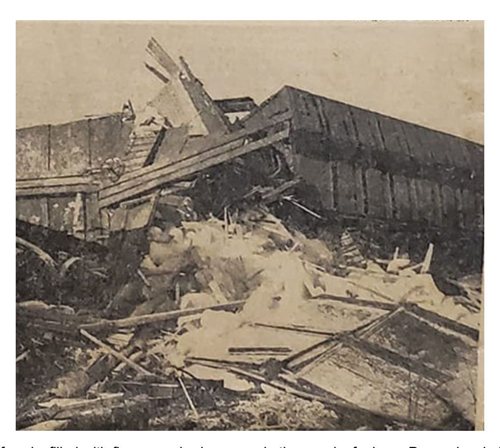
Scores of sacks filled with flour were broken open in the wreck of a large Pennsylvania freight train Saturday morning three miles southeast of Hilliard.